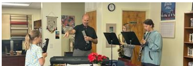
Practice makes perfect.